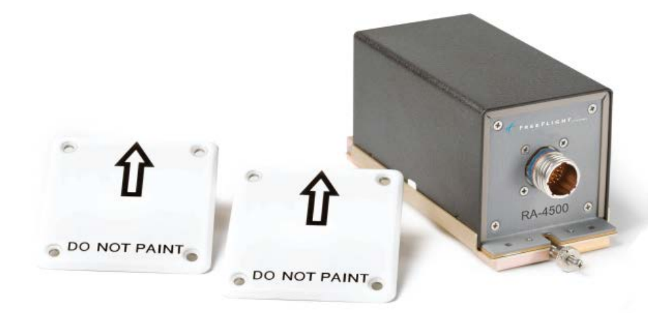
FreeFlight RA-4500 Radar Altimeter System

Consisting of a remote unit and dual antennas for increased accuracy, the RA-4500 radar altimeter system is designed to be lightweight, easy to install, and flexible in aircraft placement.