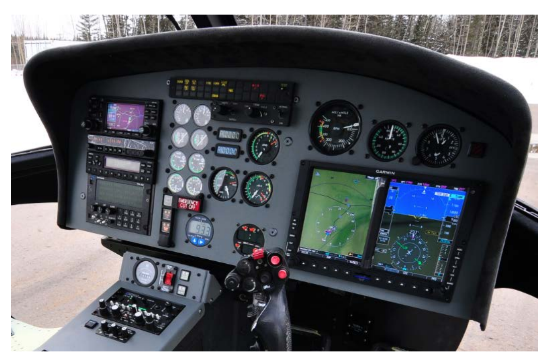
AS355N with Garmin G500H, GNS430W, GTS800, RA-4500 & Customer Specified Avionics Package

The G500H system is designed to replace the primary six round analog instruments, along with any external CDIs. A standby altimeter, airspeed and altimeter are required, re-locating existing primary instruments eliminate additional cost. The existing magnetic compass must be retained in its existing location.