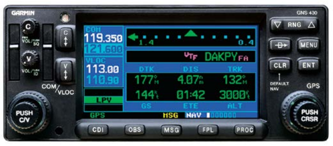
Garmin 400W Series Navigator

GPS400W/500W units come with built-in WAAS navigation capabilities. Approved to fly LPV "glideslope" approaches without