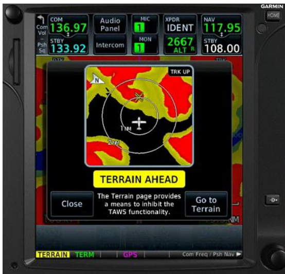
Garmin - GTN750 TAWS

Maxcraft holds several TAWS STC approvals including the Sandel ST3400 Class A TAWS in the Beech 1900C/1900D aircraft and the Garmin GTN750 GPS/NAV/COM with Class A TAWS in the Beech 1900C. Maxcraft expects to receive a new Transport Canada STC in early 2015 which will approve HTAWS enablement in the Garmin GTN750 for the EC135 helicopter.