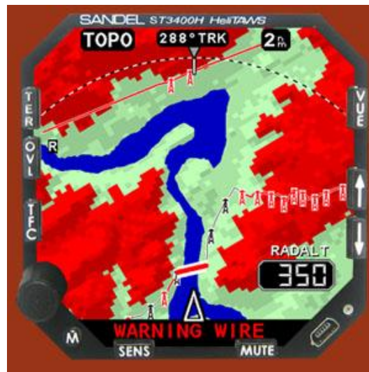
Sandel - ST3500H HeliTAWS